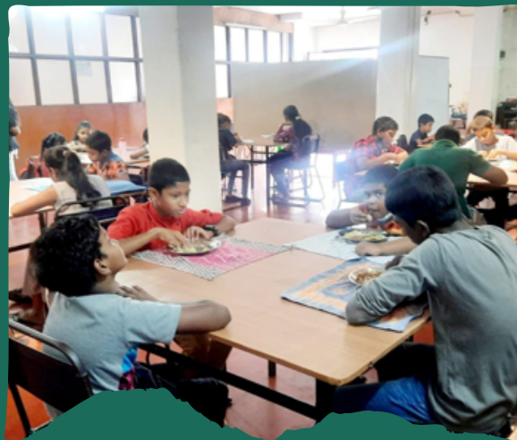
CLASSES FOR THE CHILDREN WITHIN THE COMMUNITY AROUND THE CHURCH TO HELP THEM WITH THEIR HOMEWORK AND SCHOOL SUBJECTS