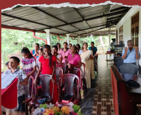
HOUSE CHURCHES ON A WEEKLY BASIS