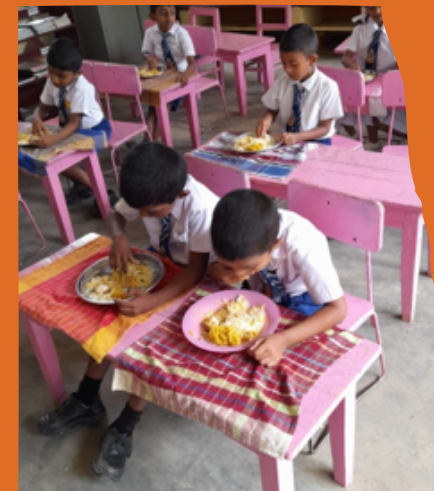
WEEKLY FEEDING PROGRAMME