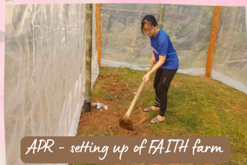
APR - setting up of FAITH farm