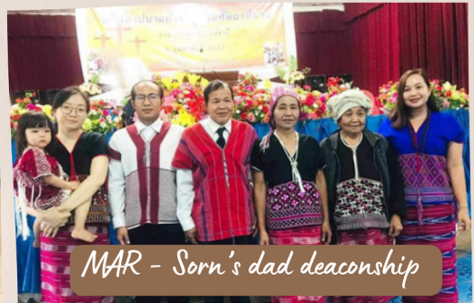
MAR - Sorn's dad deaconship