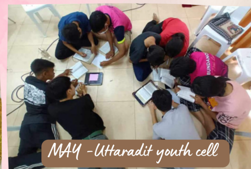
MAY - Uttaradit youth cell