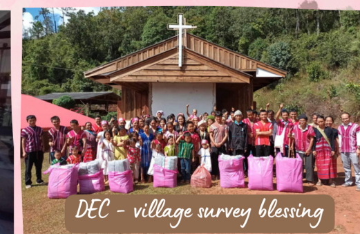
DEC - village survey blessing