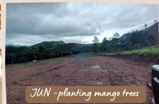
JUN - planting mango trees