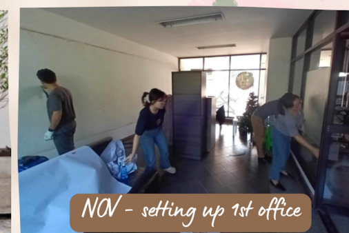
NOV - setting up 1st office