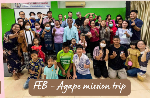
FEB - Agape mission trip