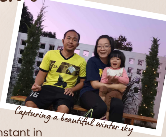
Capturing a beautiful winter sky

As the old saying goes, change is the only constant in life (well, besides God - who is the same yesterday, today, and forever). Most people do not embrace changes enthusiastically into their lives. Sometimes, change can be scary and anxiety provoking because it makes the future unknown and not within our control. Other times, change can be hard to implement because of old habits, rigid mindsets, and the influence of society, culture, and family tradition. Christians are called to change - a life transformed by Christ. The very act of repentance is change, as we choose to turn towards God and away from our own ways.