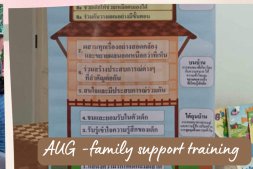
AUG - family support training