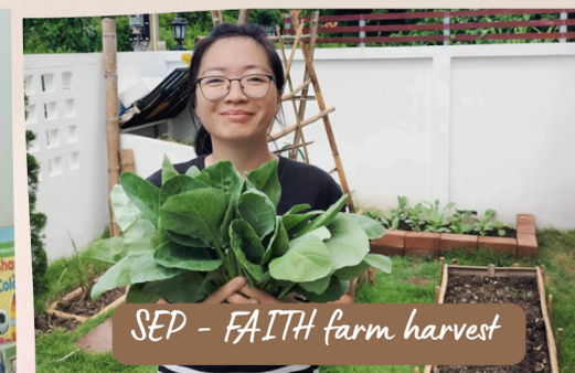
SEP - FAITH farm harvest