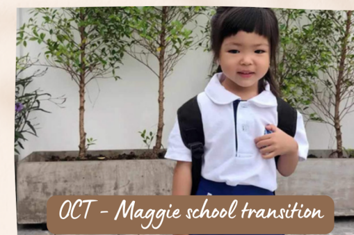
OCT - Maggie school transition