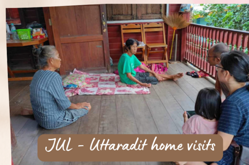
JUL - Uttaradit home visits