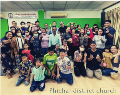
Phichai district church

Keep us in prayer as we survey the ground, that God will grant us discernment as to which district he is leading us to plant our outreach center work.