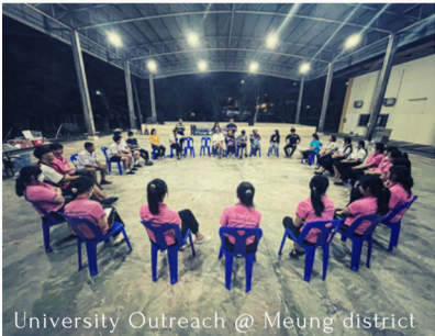
University Outreach @ Meung district