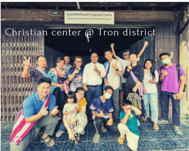
Christian center @ Tron district