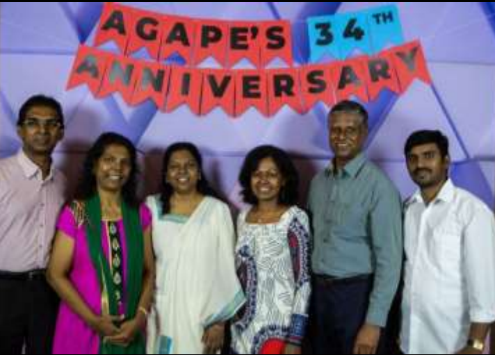
Joined the class in 2013